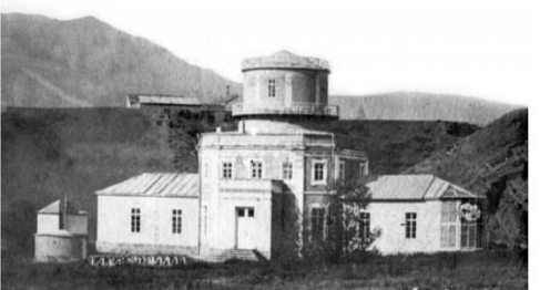
Tbilisi Magneto-Meteorological Observatory

175 YEAR OF THE ORGANIZATION OF REGULAR MAGNETO-METEOROLOGICAL OBSERVATIONS IN GEORGIA