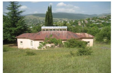
Dusheti Geomagnetic Observatory