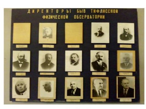
Directors of the Tbilisi Observatory