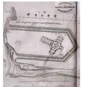
Plan of the Tbilisi Observatory (1866)