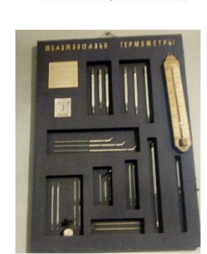
Some Instruments of the Observatory